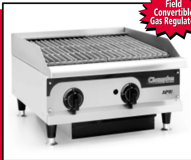
MODEL GCRB-24H GAS CHARROCK GRILL