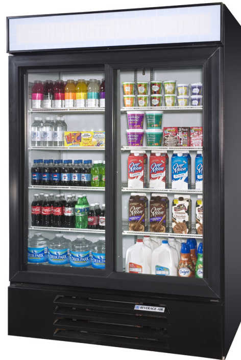
LV45 (shown with 4 shelves per section)