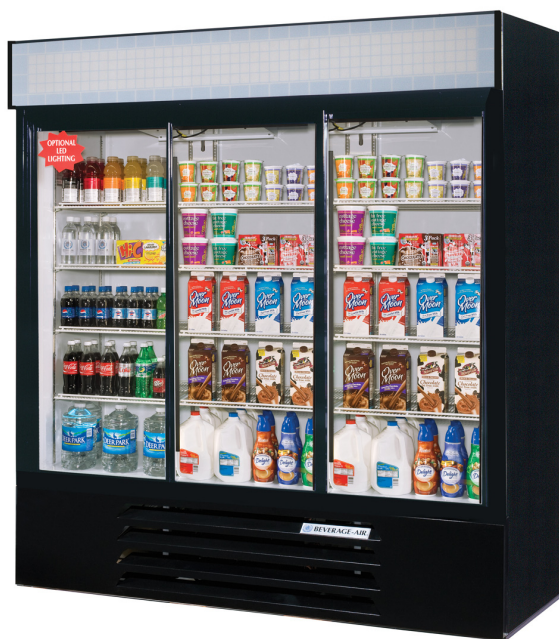
LV66Y (shown with 4 shelves per section)