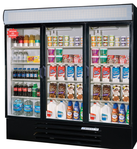
LV72Y (shown with 4 shelves per section)