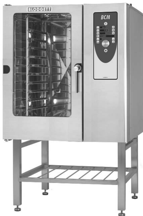
Shown on optional stand with shelf and adjustable feet