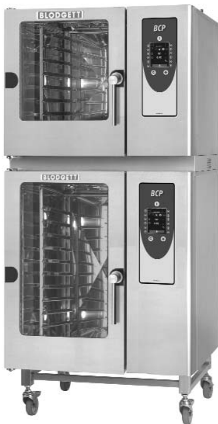
Shown on optional casters