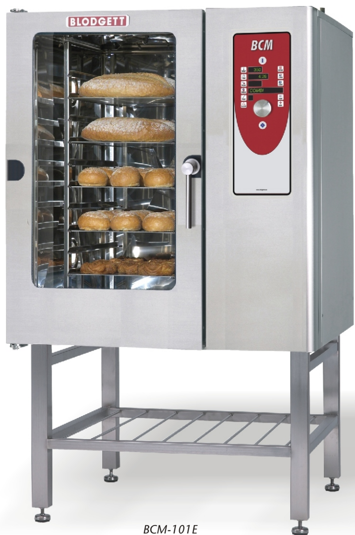
BCM-101E shown with optional stand

Combi Wash Self Cleaning System The only manual combi with self cleaning on the market!