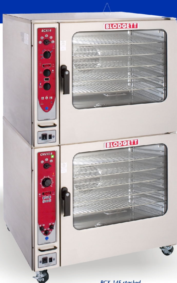
BCX-14E stacked on CNVX-14E

Want the capacity and versatility of both convection and combi? Blodgett Combi and Blodgett Oven offer the industry's largest selection of Mix and Match Combi's and Convection Ovens to meet your, needs, style of cooking and budget.