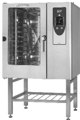
Shown on optional stand with shelf and adjustable feet

Single Electric Combination-Oven/Steamer