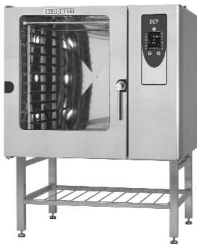
Shown on optional stand with shelf and adjustable feet

Combination-Oven/Steamer with Programmable Control