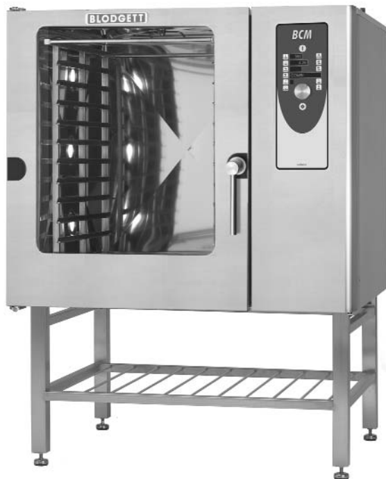
Shown on optional stand with shelf and adjustable feet