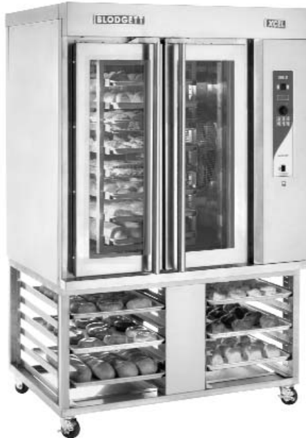
XR8-G with 12 pan stand

Refer to operator manual specification chart for listed model names.