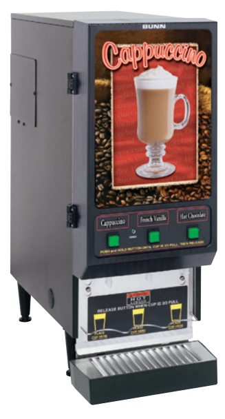
Model FMD-3 Dimensions: 30"H x 11.3"W x 23.3"D (76.2 cm H x 28.7 cm W x 59.2 cm D)