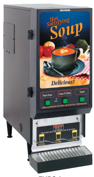
FMDS-3 front display panel