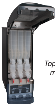
Top hinged, lift door model available.

Dimensions: 32.8"H x 12.6" W x 24.1" D (87.3cm H x 32cm W x 61.2cm D)