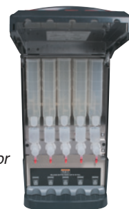
Top hinged door inside view

For current specification sheets and other information, go to www.bunn.com .