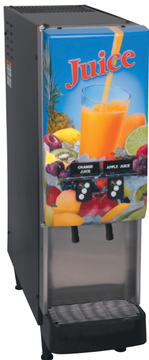
Model JDF-2S w/Lighted Graphics

Dimensions: 33.1"H x 10"W x 25.5"D (84.1 cm H x 24.9 cm W x 64.8 cm D)