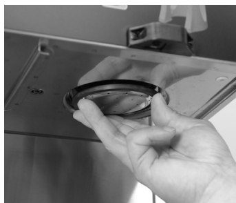
6. Reassemble sprayheads and reattach. Sprayheads only need to be hand tightened.

NOTE: Any buildup on the sprayhead and fitting may restrict water flow, and impact your coffee brewing. For consistently great coffee, clean sprayheads and fittings weekly with sprayhead cleaning tool (#38227.0000). Upon visual inspection it may appear that light passes through all holes in the sprayhead plate, but a thin film of residue can pass light and still impede water flow.