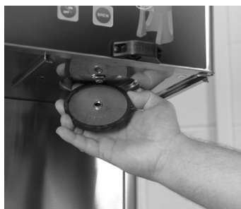
3. Remove sprayheads from brewer. Disassemble by removing the seal.