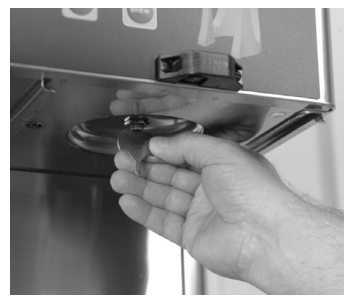
4. Insert the long end of sprayhead cleaning tool into the sprayhead fittings, and rotate several times to remove any mineral deposits from the fitting.