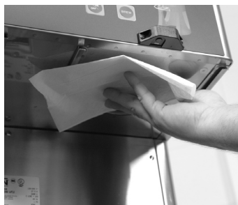
7. The use of a damp cloth rinsed in any mild, nonabrasive, liquid detergent is recommended for cleaning all surfaces on Bunn-O-Matic equipment. Do NOT clean this equipment with a water jet device.

See installation and operating manual for calibration routine to verify sprayhead flow rate matches programmed flow rate. Machine may need to be re-calibrated due to lime build up or the use of alternate designed sprayheads. If machine is cleaned and build up removed, machine must be re-calibrated to achieve desired volumes.