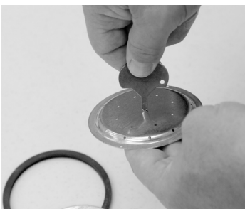
5. Use the pointed end of sprayhead cleaning tool to remove any mineral deposits from the sprayhead holes. The sprayhead holes must always remain open.

NOTE: Any buildup on the sprayhead and fitting may restrict water flow, and impact your coffee brewing. For consistently great coffee, clean sprayheads and fittings weekly with sprayhead cleaning tool (#38227.0000). Upon visual inspection it may appear that light passes through all holes in the sprayhead plate, but a thin film of residue can pass light and still impede water flow.