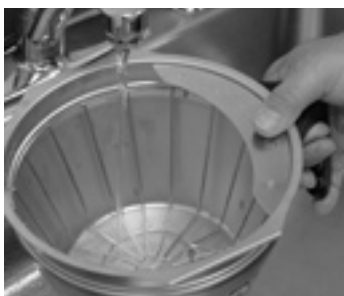
1. Clean and sanitize funnels.