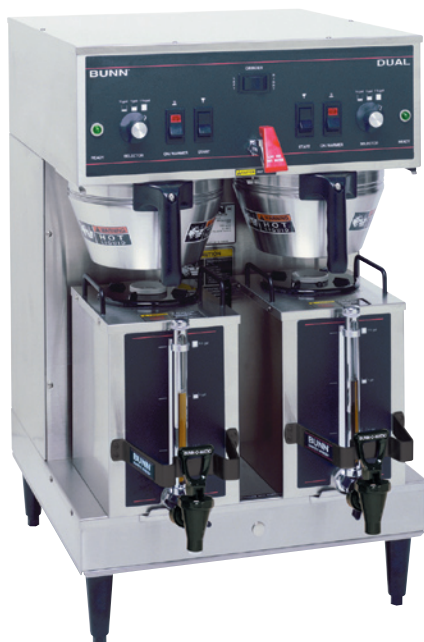
Dual with two 1.5GPR's Dimensions: 29.3" H x 18" W x 19.3" D (74.4cm H x 45.7cm W x 49cm D)