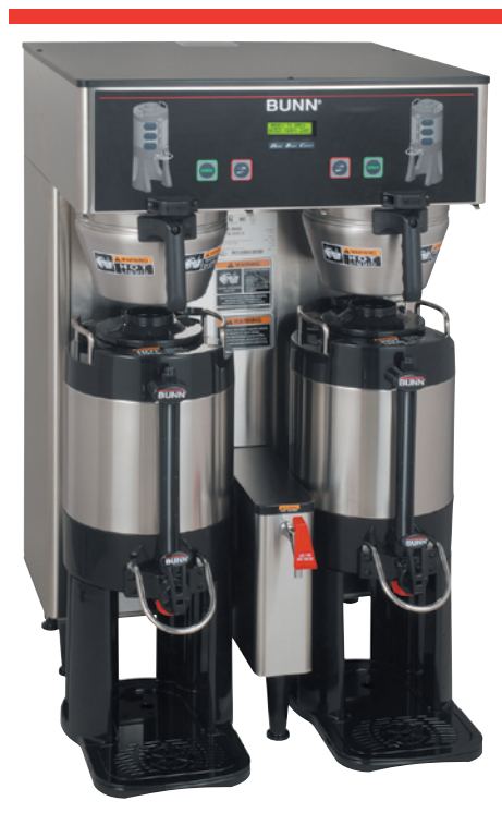
Dual TF DBC Multi-Phase with 1.5 gallon TF Servers (servers sold separately) Dimensions: 35.7" H x 21.8" W x 20.2" D (90.7cm H x 55.4cm W x 51.3cm D)