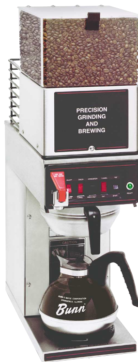
Model CWTF15 & Combo Grinder-LPG (decanter not included)