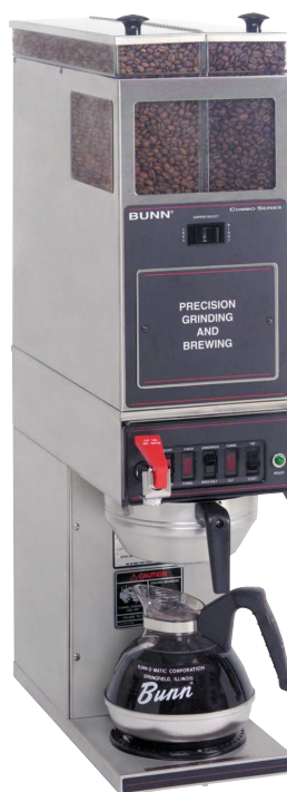
Model CWTF15 & Combo Grinder-G92HD (decanter not included)