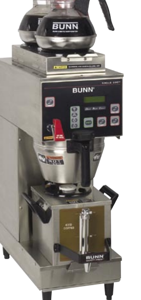
Multi-BrewWISE (servers sold separately) Dimensions: 27.4" H x 9.29" W x 20.7" D (69.6cm H x 23.6cm W x 52.6 cm D)