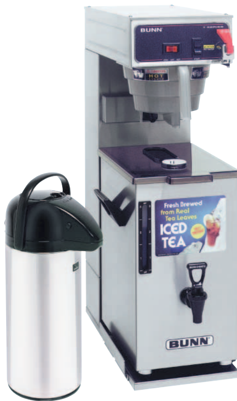
Model TNTF with TD4 Dispenser and Airpot (TD4 and Airpot sold separately) Dimensions: 31.5"H x 10"W x 23"D