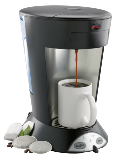
Model MCP Dimensions: 12.5" H x 8" W x 10.5" D (31.7cm H x 20.3cm W x 26.7cm D)