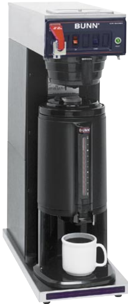
Model CWTF TS with Thermal Server (Thermal Server sold separately) Dimensions: 27.6" H x 9" W x 18.5" D (70.1cm H x 22.9cm W x 47cm D)

For current specification sheets and other information, go to www.bunn.com .