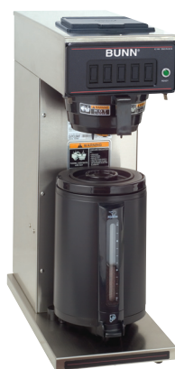
Model CW APS with TS no base

Dimensions: 23.6" H x 9" W x 18.5" D (59.9cm H x 22.9cm W x 47cm D)