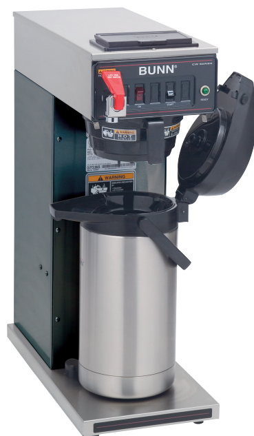
Model CWTF APS with Airpot