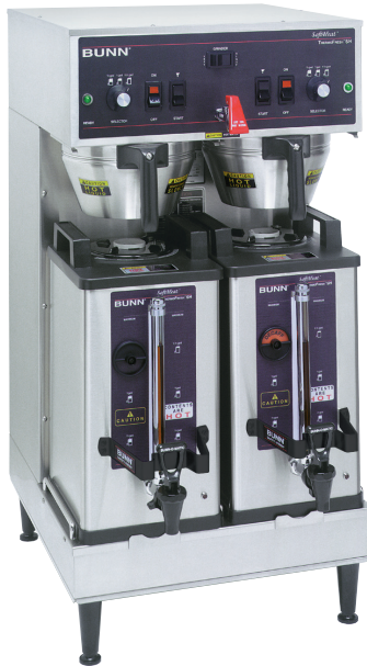
Model Dual SH Shown with 1.5 gallon SH Servers* (servers sold separately)

Dimensions: 35.8" H x 18" W x 20.5"D (91cm H x 45.7cm W x 52.1cm D)