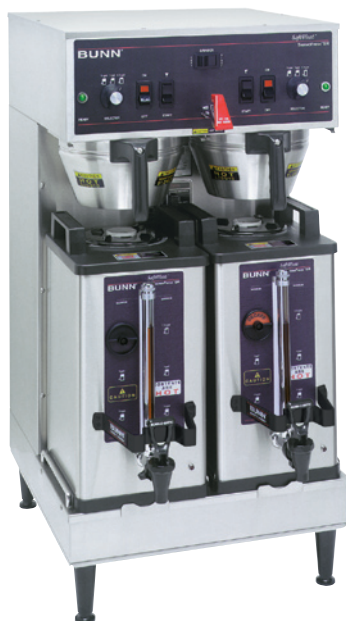
Dual SH MP with SH Servers