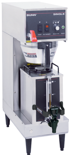
Model Single® with 1.5GPR server* Dimensions: 29.3" H x 9.25" W x 19" D (74.4cm H x 54.9cm W x 48.3cm D)