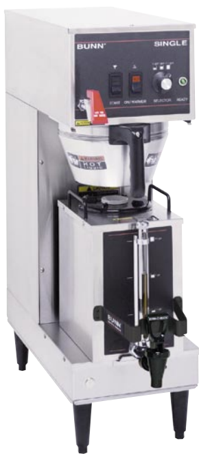
Single® with 1.5GPR server

Dimensions: 29.3" H x 9.25" W x 19" D (74.4cm H x 54.9cm W x 48.3cm D)