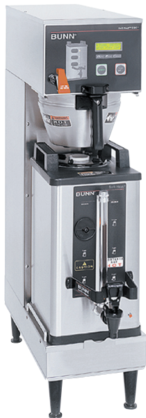
Model Single SH DBC shown with 1.5 gallon SH Servers* (servers sold separately)

Dimensions: 35.8" H x 9.3" W x 23.1" D (90.9cm H x 23.6cm W x 53.8cm D)