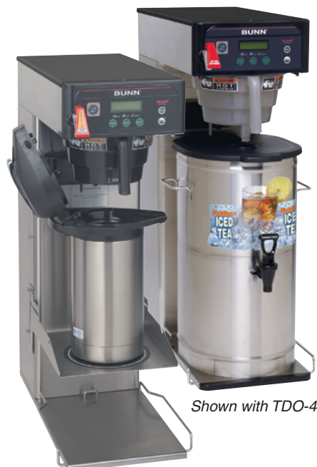
Shown with TDO-4