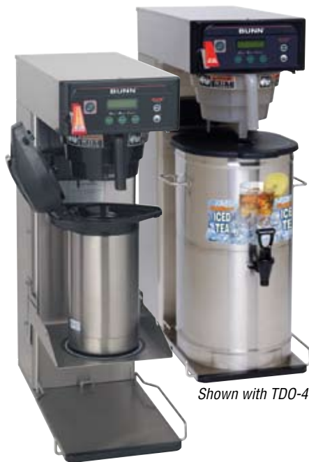
Shown with TDO-4