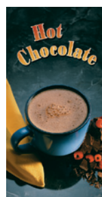
Model FMD-1 available with optional Hot Chocolate Display