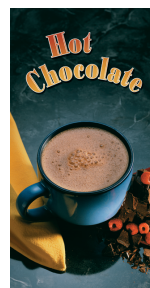
Model FMD-1 available with optional Hot Chocolate Display