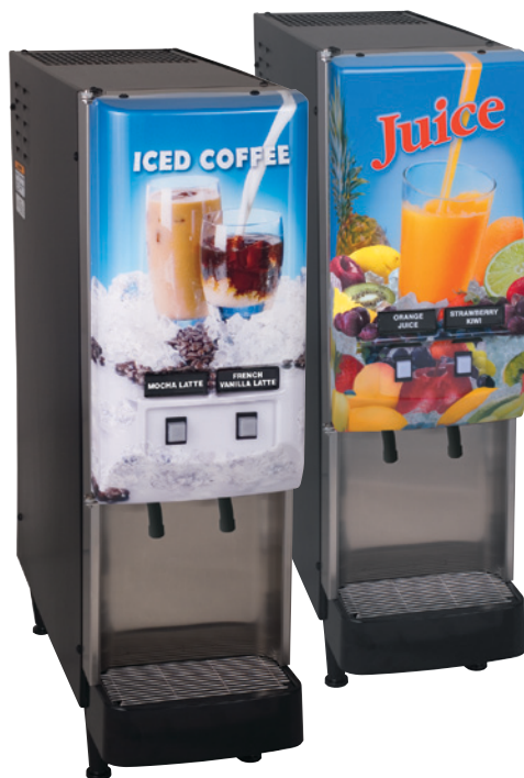
JDF-2S w/Lighted Graphics (available with iced coffee or juice display) Dimensions: 33.1"H x 10"W x 25.5"D (84.1 cm H x 24.9 cm W x 64.8 cm D) (Refillable containers sold separately)