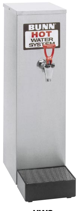
HW2 Dimensions: 24"H x 7.1"W x 14.3"D (60.96cm H x 18.03cm W x 36.3cm D)