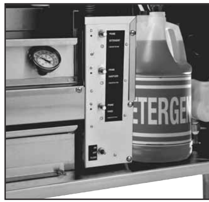
Interior controls provide easy access for changing chemical settings and service. Internal chemical storage.