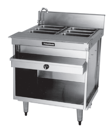
F14EW232 Shown with optional cutting board, 1/3 size pans and goose neck faucet