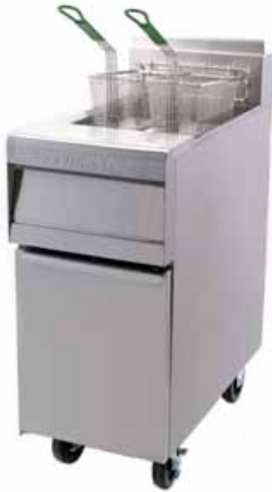
Shown with optional casters