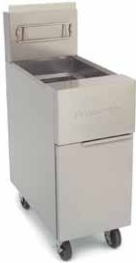
GF40 Shown with optional casters