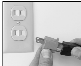
Fig. 6-2 Incorrect