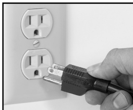
Fig. 6-1 Correct

THIS MACHINE IS PROVIDED WITH A THREE-PRONG GROUNDING PLUG. THE OUTLET TO WHICH THIS PLUG IS CONNECTED MUST BE PROPERLY GROUNDED. IF THE RECEPTACLE IS NOT THE PROPER GROUNDING TYPE, CONTACT AN ELECTRICIAN. DO NOT UNDER ANY CIRCUMSTANCES CUT OR REMOVE THE THIRD GROUND PRONG FROM THE POWER CORD OR USE ANY ADAPTER PLUG (Fig. 6-1 and Fig. 6-2).