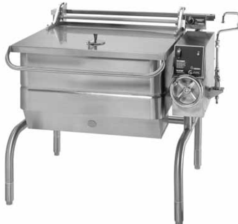
Model BPM-40G shown

A heavy-gauge, fully-adjustable one-piece cover is standard with torsion bar type counterbalance designed to maintain the selected cover position. A vent is provided in the cover top to regulate condensate buildup and a rear condensate drip shield is located under the cover to prevent condensate from dripping on floor when cover is opened.