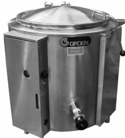
Model EE-40 shown

Kettle shall have an electric, self-contained steam source to provide kettle temperatures from 150 to approximately 270°F. Unit shall be factory charged with chemically-pure water and rust inhibitors to ensure long life and minimum maintenance.