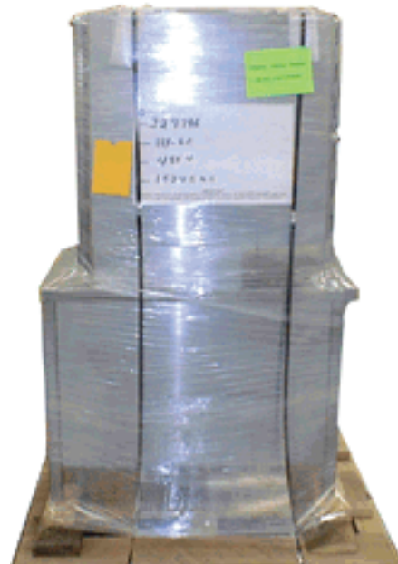
Beneath the heavy carton, the unit will be wrapped in protective plastic on a heavy skid.