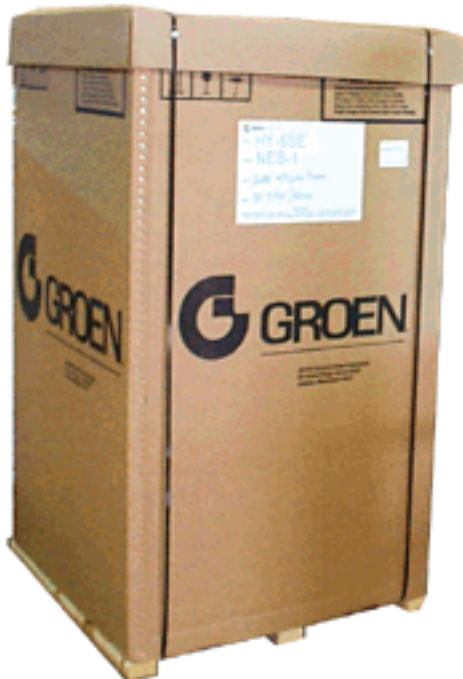
Unit will arrive in a heavy carton, mounted on a skid.

When installation is to start, cut the straps and lift the unit straight up off the skid.