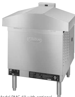
Model PMG-60 with optional Stainless Steel Body and Base and PMGH-60 Exhaust Hood