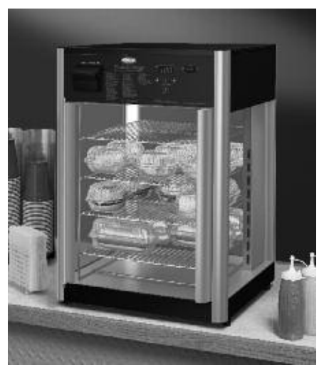
Model FDWD-2X with stationary 4-shelf multi-purpose rack