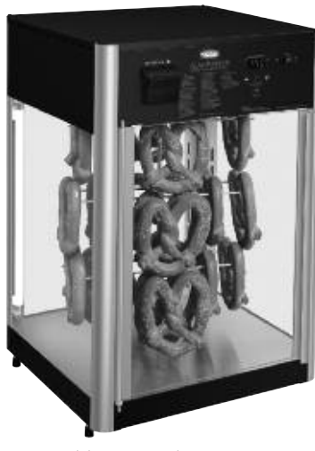
Model FDWD-1 with accessory 3-tier Pretzel Tree rack