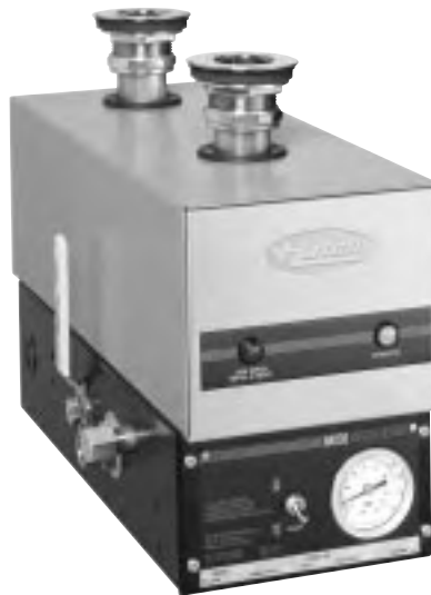
3CS-6 with optional temperature monitor