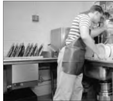
Water Temperature Recovery Table