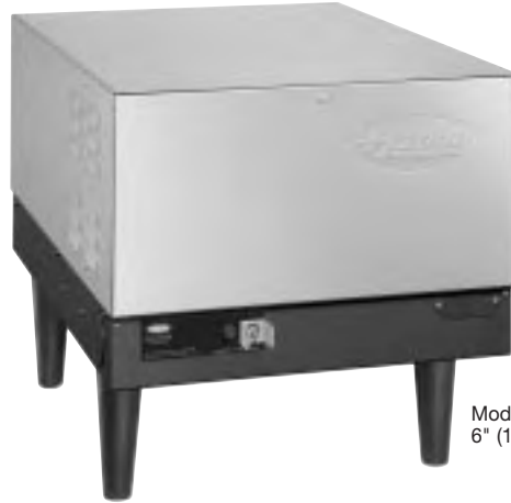
Model C-24 on 6" (152 mm) legs