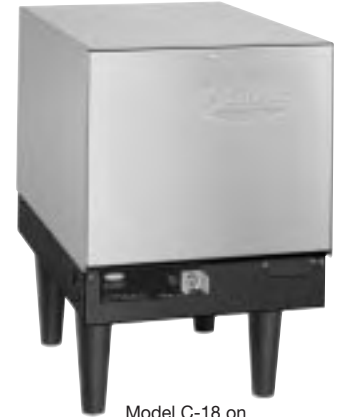
Model C-18 on 6" (152 mm) legs