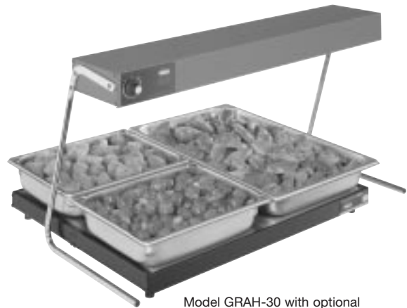
Model GRAH-30 with optional Designer color and infinite switch and accessory C-Leg stand over Heated Shelf model GRS-24 in optional Designer color

BLANKET ELEMENTS GUARANTEED AGAINST BURNOUT AND BREAKAGE FOR ONE YEAR.