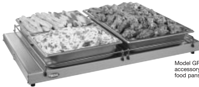
Model GRS-30 with accessory pan rail and food pans